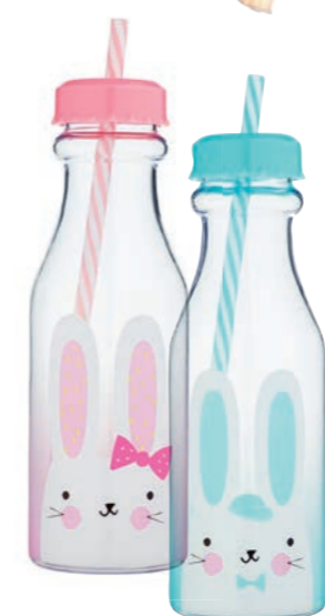
Perfect for children's drinks... no worries if they knock them over! Bunny milk bottle, £5 each, Sainsbury's