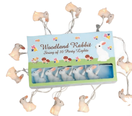
String through plants for a woodland effect indoors. Rabbit lights, £19.95, dotcomgiftshop.com