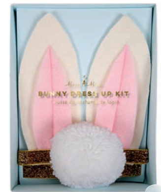
Who doesn't love playing dress-up? Felt bunny ears and pom-pom tail with glitter elasticated straps. £11.99, partypieces.co.uk