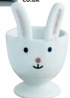
Cook up a themed breakfast of eggs and soldiers and present in this fun bunny egg cup – isn't it sweet! £3, John Lewis