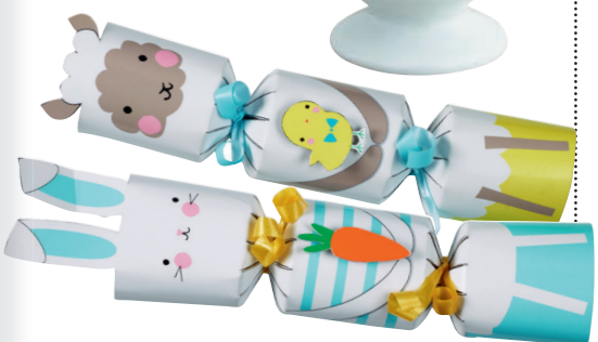
Everyone loves pulling a cracker... and now they're not just for Christmas! Easter crackers, £5 for 6, Sainsbury's