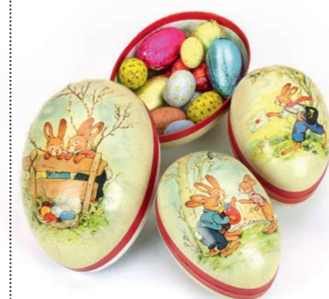
Love a retro moment! Nostalgic paper eggs you can fill with treats. A great party prize or goody bag. In two sizes, £3.95 or £4.95 each, pipii.co.uk