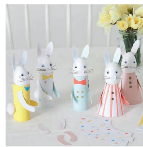
This one will keep them quiet for a while too... great if the weather's not so good on Easter weekend! Make bunnies from hardboiled eggs with sheets of push-out bunny pieces, stickers, pom-poms, googly eyes, cord for whiskers. £6.99, partypieces.co.uk