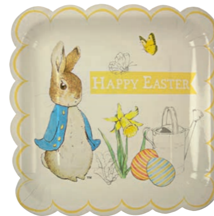
All children love Peter Rabbit! Party plates, £3.99 for 12, partypieces.co.uk