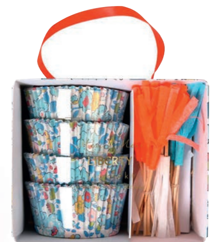
For cupcakes to impress: this Liberty Betsy floral cupcake kit has 48 Liberty printed cases and 24 decorative toppers. £9.99, partypieces.co.uk

Find more Easter buys on womanandhome.com/easterdecoration