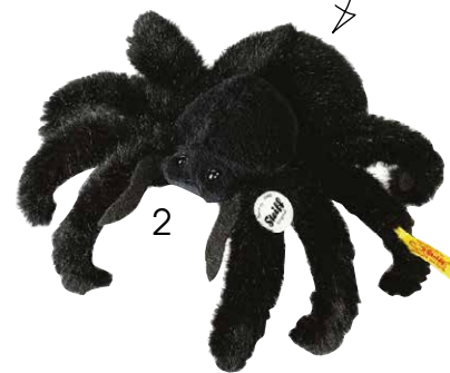
Hide this spooky spider in your home to surprise guests