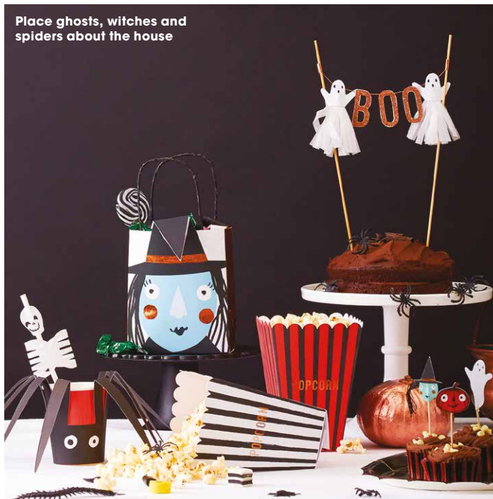
Place ghosts, witches and spiders about the house

CAROLE'S TOP TIP “ Make sure you're well prepared for trick or treaters with a big bucket of sweets and treats! ”