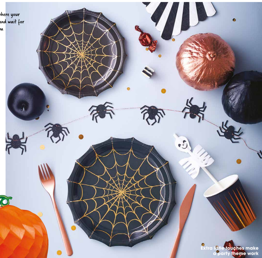
Extra little touches make a party theme work